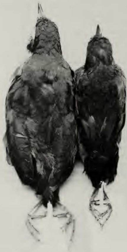
FIG. 1. Specimens of the Cundinamarca Antpitta ( Grallaria kaestneri ) (right) and the Santa Marta Antpitta ( G. bangsi ) (left). Note differences in size, throat pattern, ventral streaking, and extent of white on abdomen.

PLUMAGE VARIATION. —The plumage of no. 30731 is virtually identical to that of the type, while in no. 30732 the basal olive portions of the feathers of the breast and sides are slightly paler than the tips, producing a slightly smudgy appearance. No plumage variation was detectable among birds seen in the field, undoubtedly including individuals of both sexes (see below). Variation in measurements among the type series is slight (Table 1).